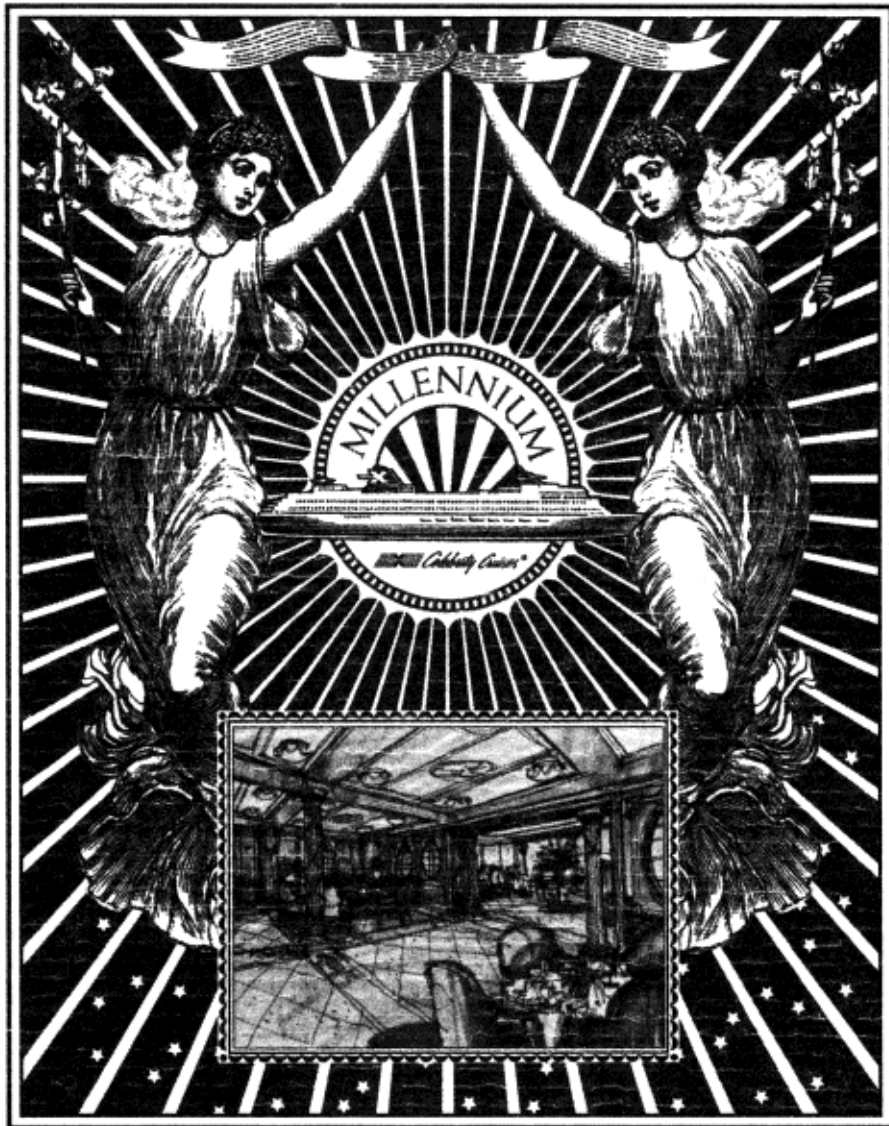
CELEBRITY MILLENNIUM - THE OLYMPIC